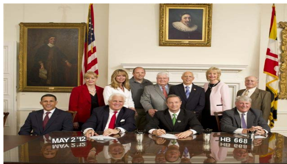
Governor Martin O'Malley makes his signature on the Bill